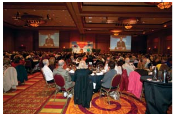
The Ballroom at Embassy Suites, a gracious venue.